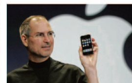
Steve Jobs: an American businessman, co-founder of Apple Inc.