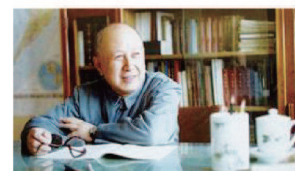
Qian Xuesen: a Chinese scientist, father of China's space programs

Pair work: Look at the two photos below. Then work with your partner and answer the questions that follow. You may want to search online for information by using your cell phone to scan the QR codes (二维码).